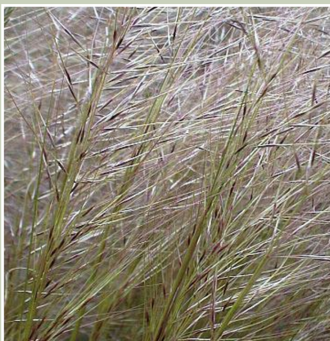
Native: corkscrew grass