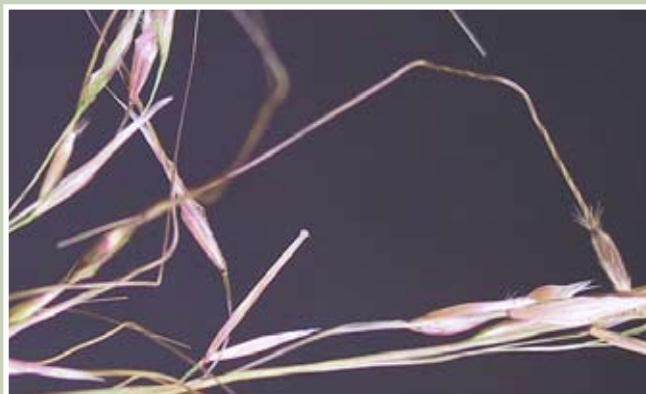
Native: double-jointed spear grass