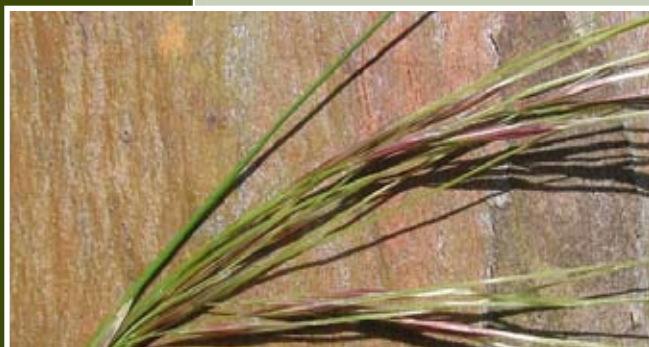
Weed: Chilean needle grass