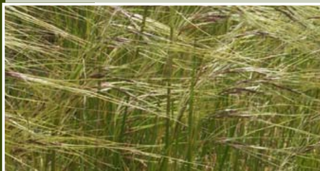
Weed: Chilean needle grass