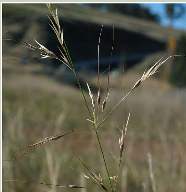
Native: tall spear grass