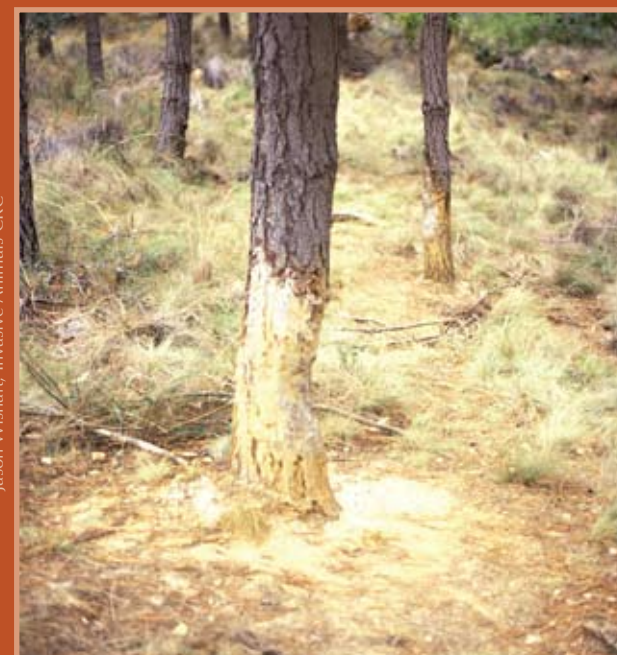
Damage to a tree from a pig rubbing on it