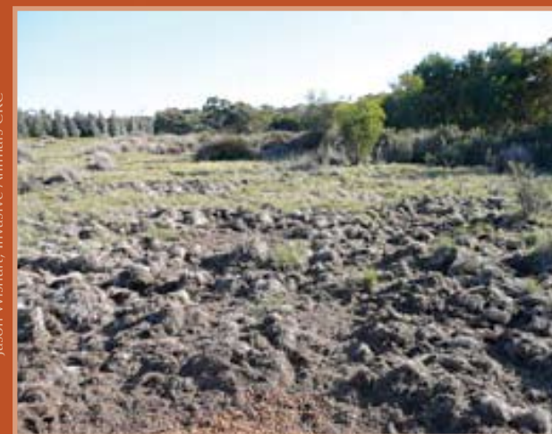
Wild pig damage to ground cover and soils