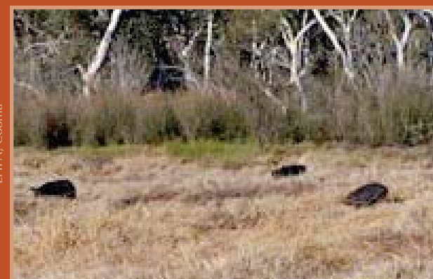
Wild pigs grazing