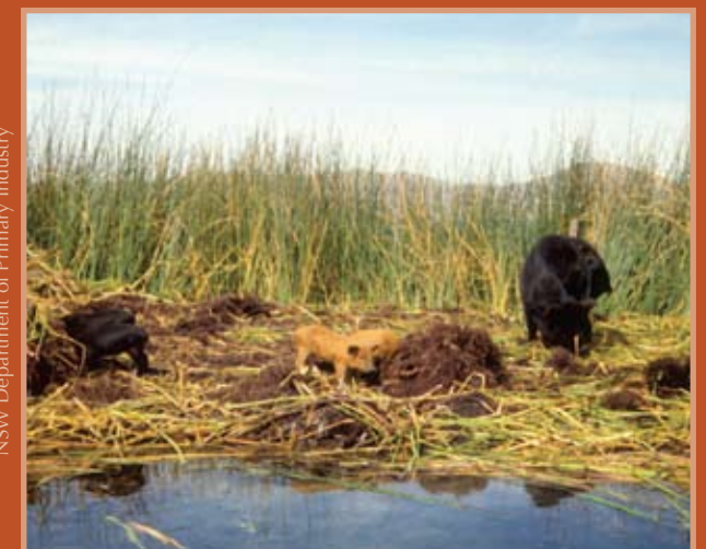
NSW Department of Primary Industry