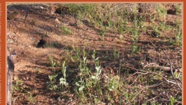
Rabbit burrows in disturbed soils created by overgrazing

Waltraud Pix from Friends of Mount Majura