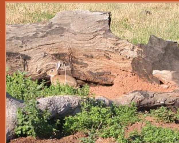
Rabbit emerging from burrow

Note the weed invasion associated with burrows