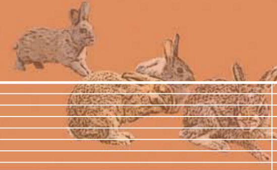
Waltraud Pix from Friends of Mount Majura