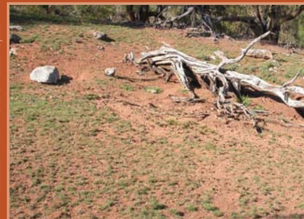
Loss of groundcover due to rabbit and kangaroo grazing